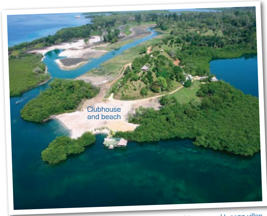
Deep water canal lots, beach clubhouse and lagoon villas