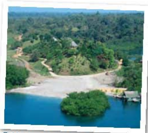
Clubhouse area, beach and hilltop rancho