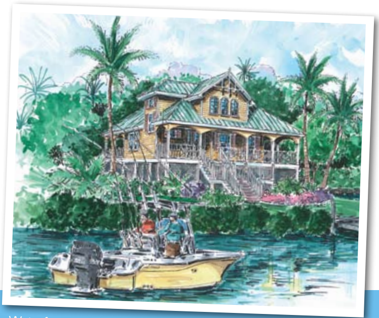
Waterfront homes, each with their own private boat basin

Villas nestled along a sparkling lagoon. Secluded single-family residences tucked among the thickly wooded hills of a tropical forest. Waterfront homes overlooking coral reefs with breathtaking views of the mountains of Panama. However you define living in paradise, you'll find it at Sunset Point.