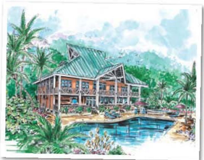
The Club House

The Casa Club at Sunset Point will be a favorite gathering place for residents and their guests. This expansive club house will feature a full-service restaurant and bar, fitness center, game room, and treatment areas for massage and yoga. Surrounded by lush tropical vegetation, there is also a private tennis court. Owners will also enjoy a private beachfront pool just steps from Sunset Point's Laguna Beach with barbeque grills and volleyball court.